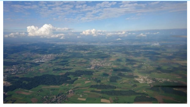
Figure 1: Typical landscape on the Swiss plateau (view from the south-west to Lake Zurich

Case Study 7 is based in the Swiss Plateau, a relatively flat area of about 11,000 km<sup>2</sup> that agricultural production facilitates and settlements (Fig. 1). Maintaining biodiversity and freshwater ecosystems here is challenging from due to pressures anthropogenic land use (e.g. agricultural, urban, industrial), energy production, traffic infrastructure (roads, railroads, etc.), recreational activities. among others. find Environmental managers have to